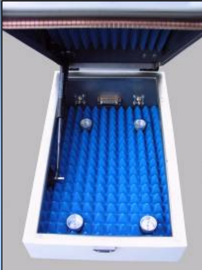
Absorber for reflections